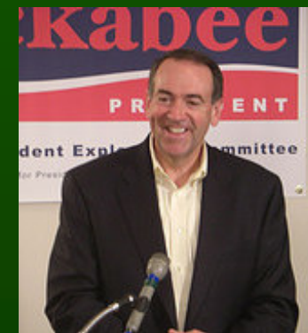
Governor Mike Huckabee

We were not too excited about any of the presidential candidates until about a month ago, we took a closer look at the one of the “second-tier” candidates – Governor Mike Huckabee. We really were surprised to see what a fine candidate he was – only problem was that very few gave him a chance. In the past two weeks, he has risen dramatically in the national polls, has started getting a lot of media attention and is raising some significant funds. So, if you are not already decided on a candidate to support, you might want to consider Governor Huckabee. We have attached two nonpartisan articles written by political correspondents who think Huckabee has a real chance at getting the GOP nomination. For more information on Mike, you could check out his website at mikehuckabee.com