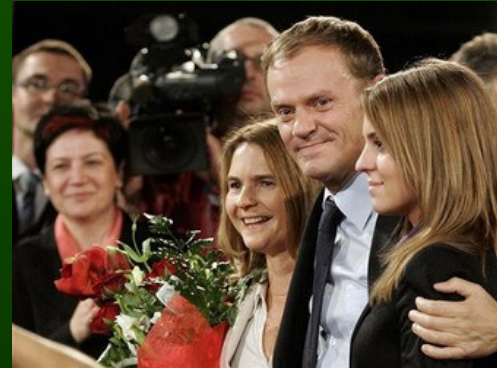
Our new Polish Prime Minister – Donald Tusk at victory celebration with his wife and daughter

For almost five years now, our group Poland For Jesus has been coordinating 24/7 prayer for the country with a strong emphasis on praying for God to raise up godly leadership. In the elections for Parliament held on October 21, in the last week, the political party Civic Platform broke out of a dead heat with the current ruling party to a 13% victory in the elections. This party, which we definitely felt was God's choice for the country will form the new government. Without giving details, we can state categorically that prayer played a very significant result in these election results and that God has opened a door for some of our closest friends here in Poland to be personal prayer supporters of some very important government officials.